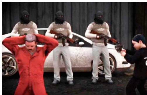
Image from propaganda video that imitates a video game

soldiers is covered up, ISIS is open about its use of children via the propaganda that glorifies the young martyrs. The group deliberately flaunts the use of minors. This is to shock the enemy on the one hand and to instil fear on the other. It is possible that ISIS will not show restraint in using children to commit attacks in Europe. After all, this is already happening in Syria and Iraq, as shown in the videos about under-age suicide terrorists.