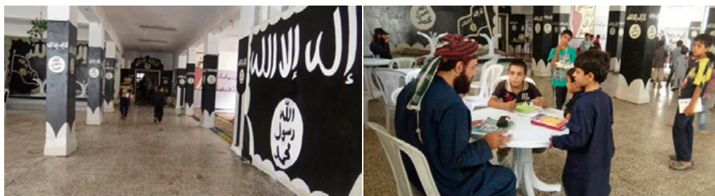
An ISIS school as portrayed in propaganda

ISIS propaganda reveals the crucial role assigned to education in the 'caliphate'. This is reflected in the establishment of the 'ministry of education' which made education mandatory for boys between the ages of 6 and 18 and girls between the ages of 6 and 15. 6 Despite this requirement, it is unlikely that all children in ISIS-held territory actually attend school. A considerable part of the local population and possibly some foreign terrorist fighters likely keep their children at home. In addition, the worsened security situation means there are fewer and fewer properly functioning schools. Some schools have been forced to close – temporarily or otherwise – on account of a lack of employees.