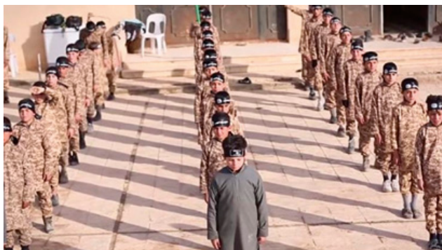
Image from a propaganda video on training camps for children

Boys can be selected by ISIS to join a training camp where they can practice skills and receive training in the use of firearms and bladed weapons. These training camps are separate from education at schools. ISIS criteria when selecting boys include conformity with the group, following the rules and unquestioning obedience. Boys may also be brought to a camp by their parents, or decide on their own to sign up. These camps are modelled on the jihadi training camps for adults. Boys may be able to participate when they are as young as 9, and are assigned to specialised programmes for fighters, attackers, bomb makers and snipers. The programme comprises ideological and military education. For example, a typical day in a training camp includes Koran lessons, physical training and learning tactics such as using a dummy to practise beheading.