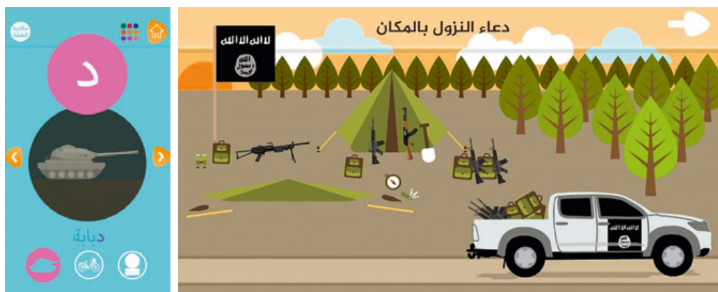
Apps for young children

The indoctrination of children starts at a young age. The app Huroof (alphabet), intended for the youngest, teaches them violent concepts or jihadist words such as ‘dababa’ (tank) in a playful way. There are also apps that provide a game setting in which children can attack coalition countries, for example by firing rockets at Western fighter jets or the Eiffel Tower.