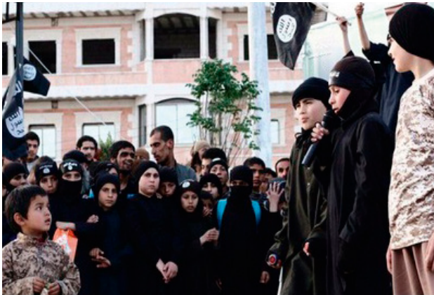
Underage preacher in propaganda video

Some minors play a specific role within the ISIS organisation, ranging from housewife or informer to soldier or executioner. Children, both boys and girls, are pressured into reporting on family members, neighbours or friends who do not obey the rules of ISIS. In this sense, the 'caliphate' operates as a totalitarian state that wants to control its citizens. The use of children for such roles is customary in a totalitarian regime. When children have proven to be loyal to ISIS by competently fulfilling this role, they can advance to a role that comes with more responsibilities.