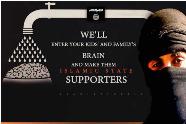
Example of ISIS propaganda