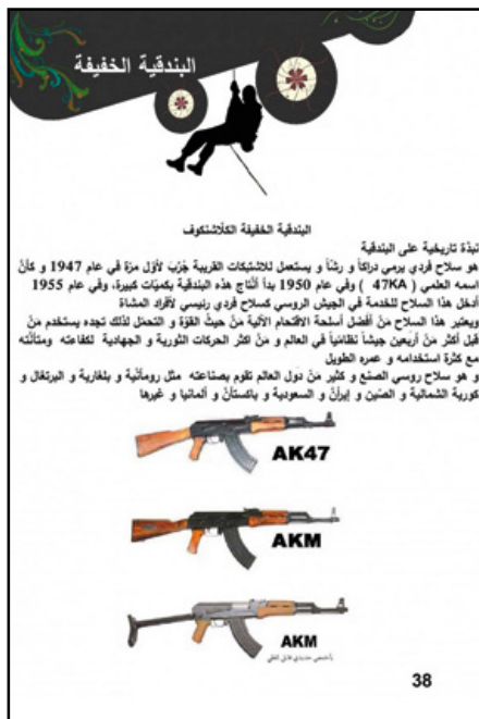
Page from an ISIS textbook about the deployment and use of weapons

Textbooks, such as the primary education textbook 'I Am Muslim', substantiate a world view in which ISIS beliefs are true and all others are false. Course materials are illustrated with pictures of hand grenades, tanks and battle positions to link education with the ISIS military strategy. Furthermore, children receive theory lessons on topics related to battle, such as identifying different types of weapons and the situations to which these are best suited. A key focus of the curriculum is on reinforcing the sense of us-versus-them. The 'Crusader coalition' (of which the Netherlands is a part) is the enemy here that must be wiped out. 7 Anyone who does not speak out against the coalition is labelled an infidel or, in the case of Muslims, an apostate. This means that according to ISIS he or she can be killed.