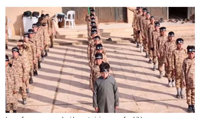
Image\ from\ a\ propagand a\ video\ on\ training\ camps\ for\ children

Boys can be selected by ISIS to join a training camp where they can practice skills and receive training in the use of fireams and bladed weapons. These training camps are separate from education at schools. ISIS criteria when selecting boys include conformity with the group, following the rules and unquestioning obedience. Boys may also be brought to a camp by their parents, or decide on their own to sign up. These camps are modelled on the jihadi training camps for adults. Boys may be able to participate when they are as young as 9, and are assigned to specialised programmes for fighters, attackers, bomb makers and snipers. The programme comprises ideological and military education. For example, a typical day in a training camp includes Koran lessons, physical training and learning tactics such as using a dummy to practise beheading.