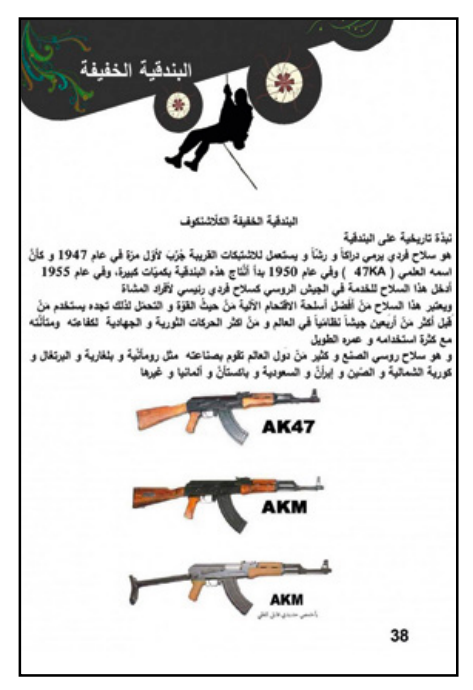
Page from an ISIS textbook about the deployment and use of weapons

Textbooks, such as the primary education textbook 'I Am Muslim', substantiate a world view in which ISIS beliefs are true and all others are false. Course materials are illustrated with pictures of hand grenades, tanks and battle positions to link education with the ISIS military strategy. Furthermore, children receive theory lessons on topics related to battle, such as identifying different types of weapons and the situations to which these are best suited. A key focus of the curriculum is on reinforcing the sense of us-versus-them. The 'Crusader coalition' (of which the Netherlands is a part) is the enemy here that must be wiped out.<sup>7</sup> Anyone who does not speak out against the coalition is labelled an infidel or, in the case of Muslims, an apostate. This means that according to ISIS he or she can be killed.