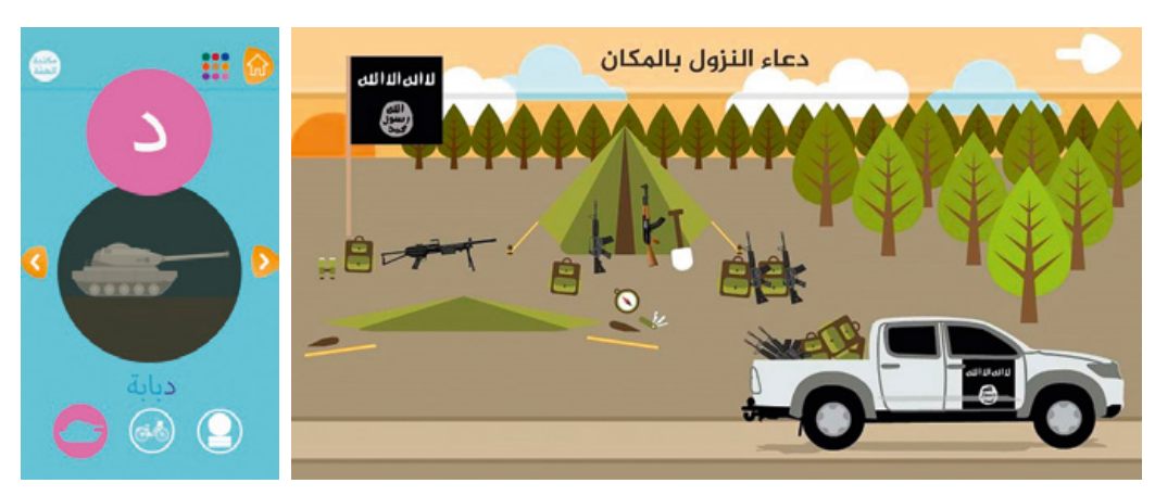
Apps for young children

The indoctrination of children starts at a young age. The app Huroof (alphabet), intended for the youngest, teaches them violent concepts or jihadist words such as 'dababa' (tank) in a playful way. There are also apps that provide a game setting in which children can attack coalition countries, for example by firing rockets at Western fighter jets or the Eiffel Tower.