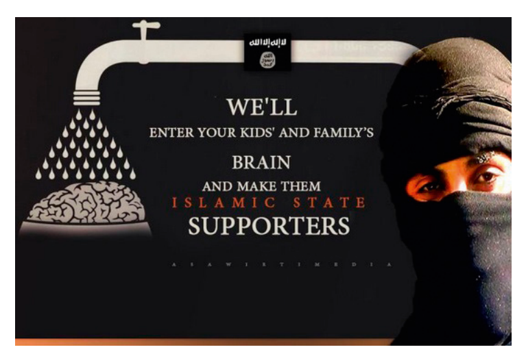
Example of ISIS propaganda