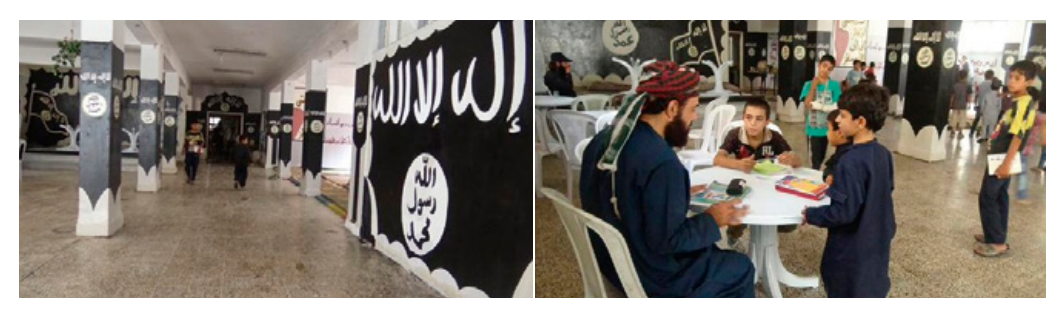
An ISIS school as portrayed in propaganda

ISIS propaganda reveals the crucial role assigned to education in the 'caliphate'. This is reflected in the establishment of the 'ministry of education' which made education mandatory for boys between the ages of 6 and 18 and girls between the ages of 6 and 15.6 Despite this requirement, it is unlikely that all children in ISIS-held territory actually attend school. A considerable part of the local population and possibly some foreign terrorist fighters likely keep their children at home. In addition, the worsened security situation means there are fewer and fewer properly functioning schools. Some schools have been forced to close - temporarily or otherwise - on account of a lack of employees.