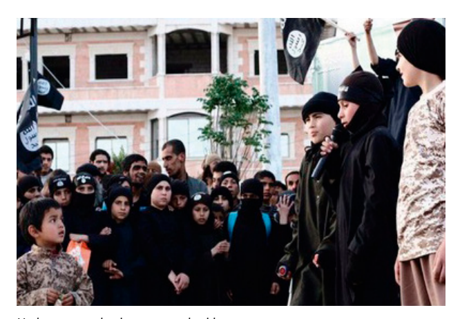
Underage preacher in propaganda video

Some minors play a specific role within the ISIS organisation, ranging from housewife or informer to soldier or executioner. Children, both boys and girls, are pressured into reporting on family members, neighbours or friends who do not obey the rules of ISIS. In this sense, the 'caliphate' operates as a totalitarian state that wants to control its citizens. The use of children for such roles is customary in a totalitarian regime. When children have proven to be loyal to ISIS by competently fulfilling this role, they can advance to a role that comes with more responsibilities.