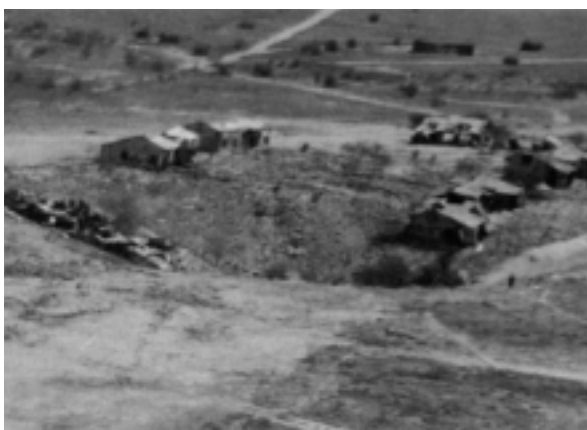
Nuclear test site at Rajasthan, India

Syria has programmes for the development of chemical weapons and ballistic missiles. The country sees these weapons as an indispensable deterrent in case of, for example, rising regional tensions. Syria is no party to the Chemical Weapons Treaty.