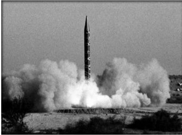
Pakistani test of the Ghauri missile in April 1999

committed itself to destroy its chemical weapons. Pakistan, too, is a member of the CWC. Neither India nor Pakistan have joined the Nuclear Non-Proliferation Treaty 1 , and so far both countries have refused to sign the Comprehensive Test Ban Treaty. Meanwhile they are continuing the development of their respective nuclear weapons programmes. In May 1998 both countries carried out nuclear tests; in 1999 and 2002 they both tested medium-range and long-range missiles.