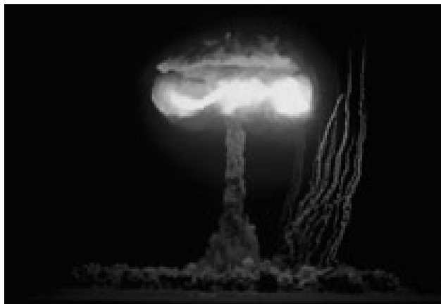
Nuclear explosion

In order to produce nuclear weapons (nuclear explosion weapons) it is necessary to have plutonium or highly enriched (weapons-grade) uranium. These fissionable materials are not freely available on the international market. They can only be produced through complicated separation processes, for example in a nuclear reactor or ultracentrifuge system. So if a country or organisation wishes to develop a nuclear weapons programme, it needs nuclear projects for the production of the required fissionable material. Civilian nuclear projects, like nuclear energy projects, usually do not require plutonium or highly enriched uranium.